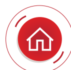
Shelter in Place