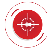
GUN SHOT DETECTION